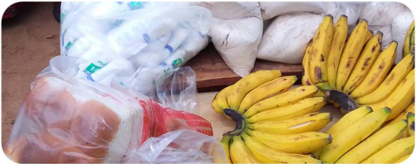
Types of food given to total orphans in October 2023