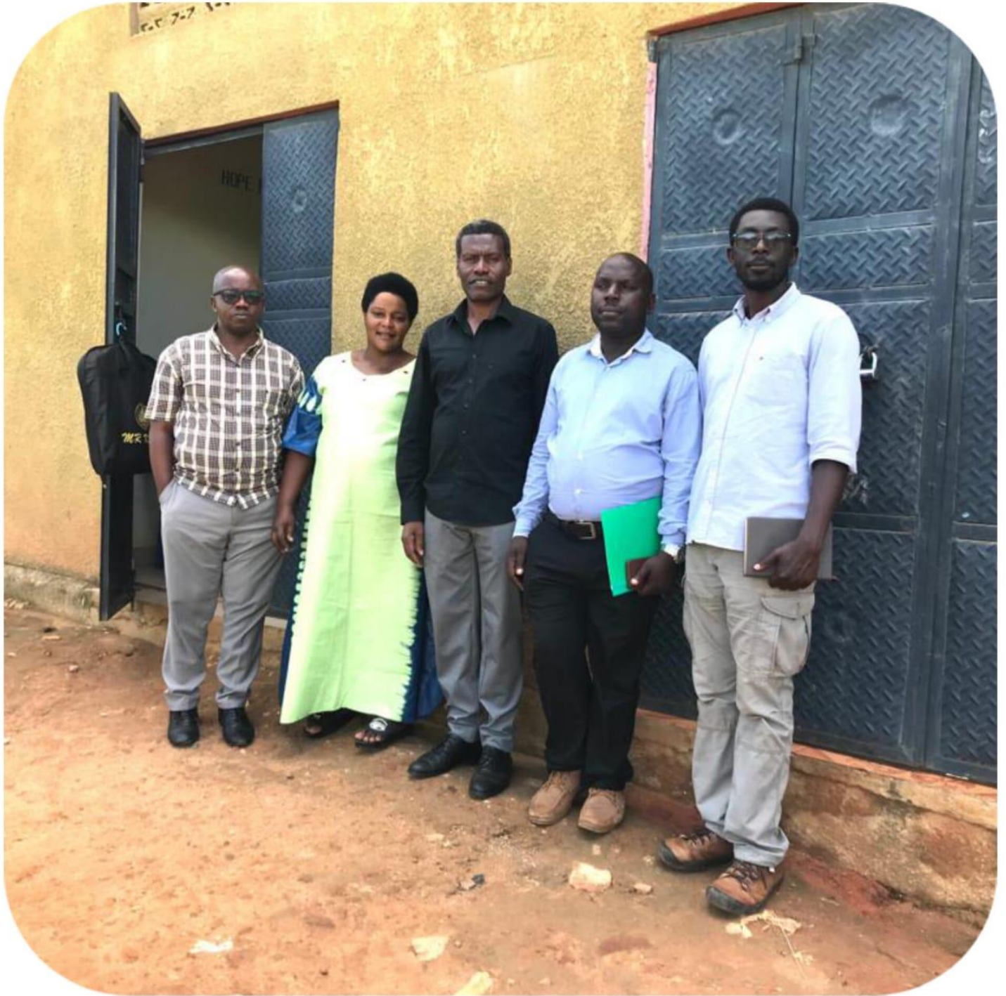
HEM Executive Committee after a meeting held on 17 th October 2023 at Bukasa Kampala