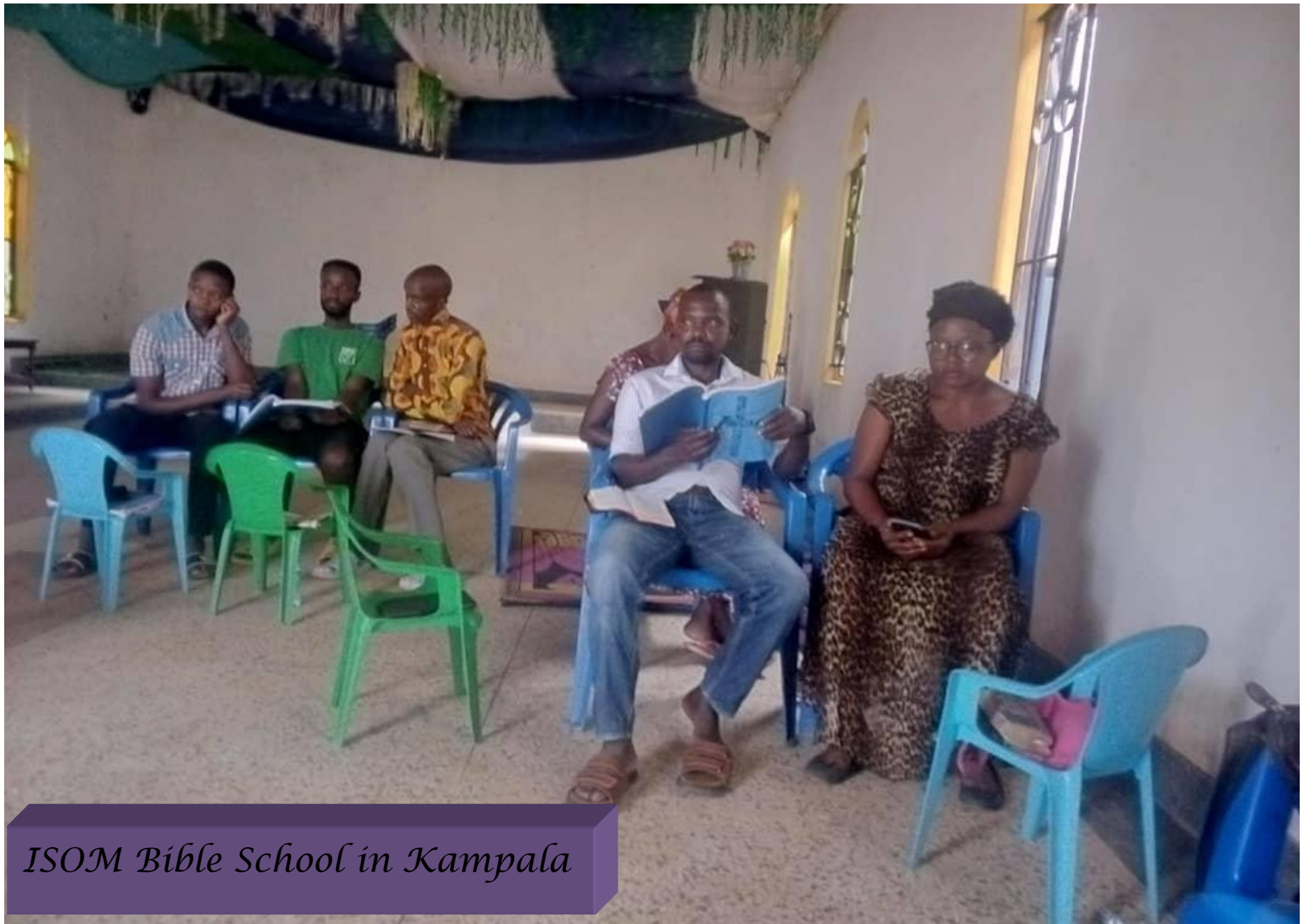
ISOM Bible School in Kampala