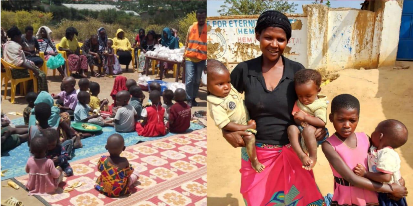
HEM Total orphans support in Kyaka II, Nakivale and Kyangwali Refugee Settlements