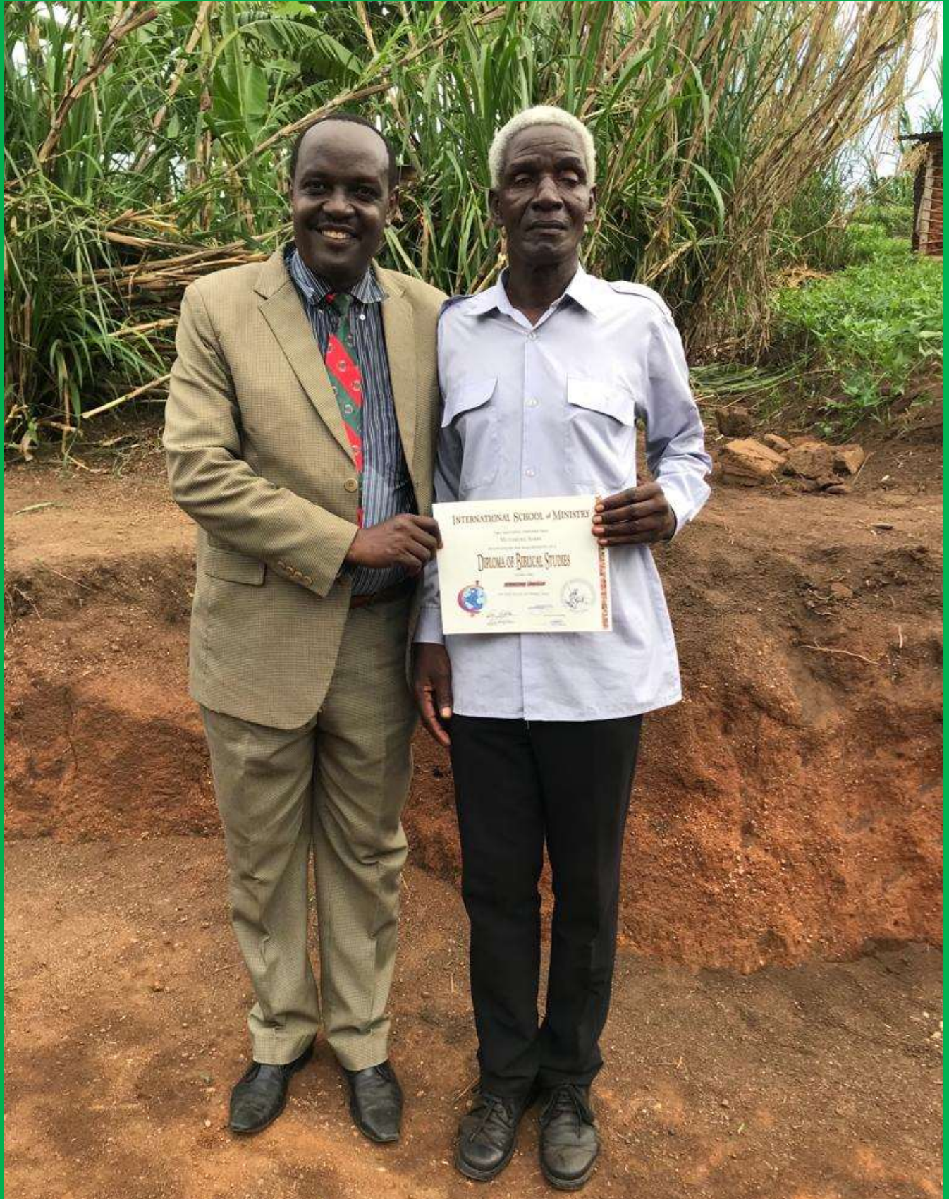
In Jesus's name even old people do training in Bible School. Please encourage everyone to learn Bible school