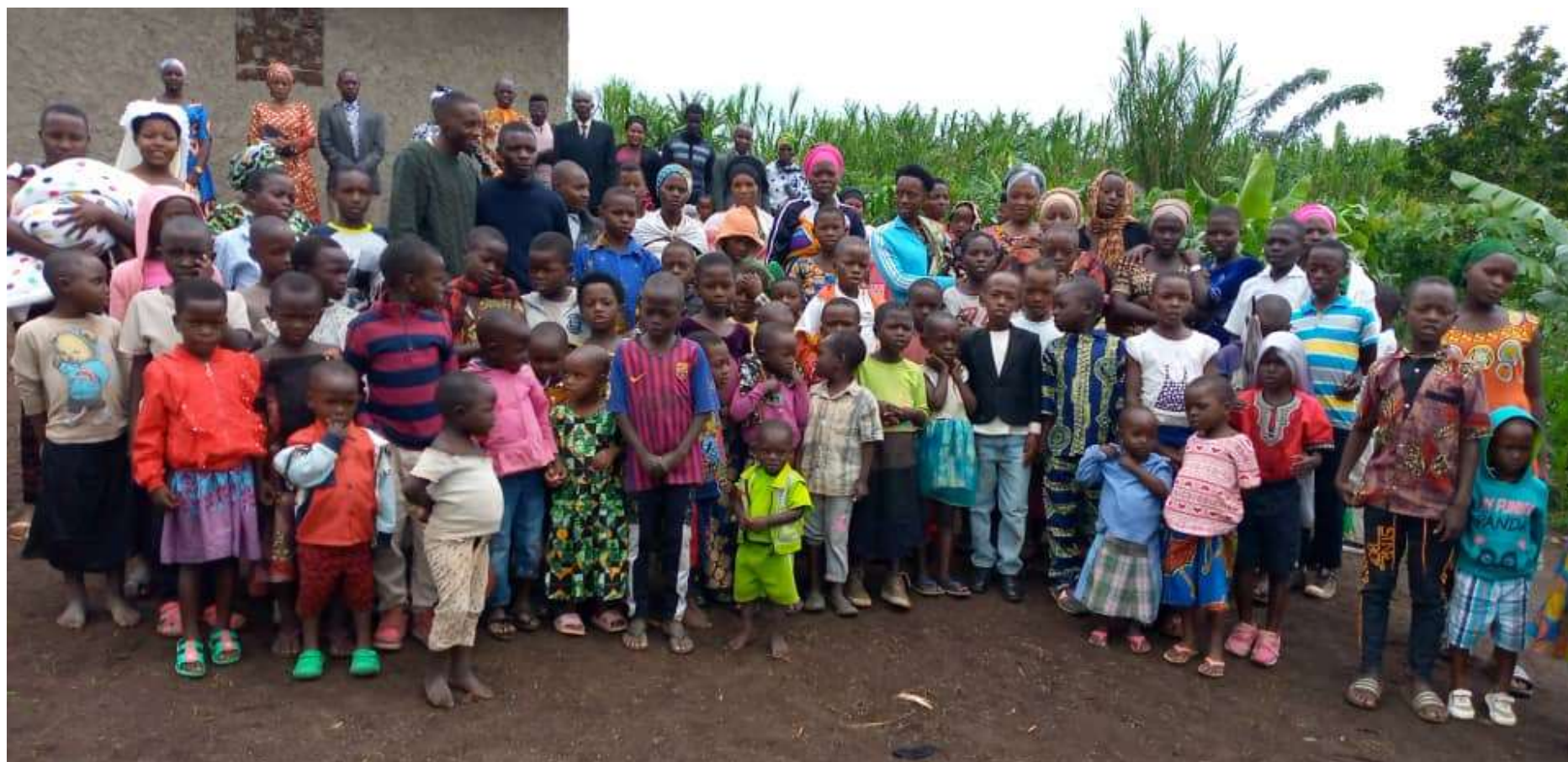
HEM Pentecostal Church Byabakora in Kyaka II Refugee Settlement