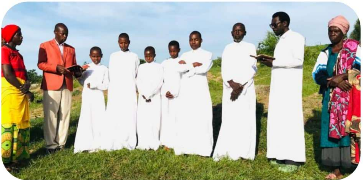
Baptism Ceremony in HfEM Pentecostal Church Byabakora