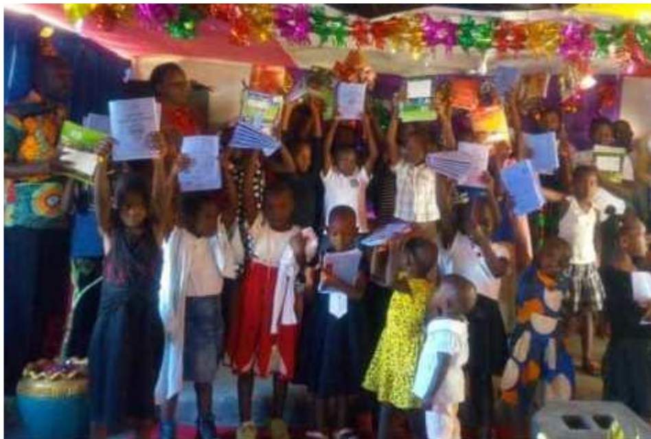
Pupils assisted in primary education in March 2020: 30 urban refugees (Kampala City) and 20 in Kyaka II Refugee Settlement

Education is the key for a sustainable development. In the perspective of humanitarian action but also in the community development perspective HEM is engaged in supporting education in refugee settlements (Kyaka II and Nakivale up to now) and in urban centers including Kampala and the surroundings. These pictures sample the pupils assisted by HEM by paying school fees and providing scholastic materials.