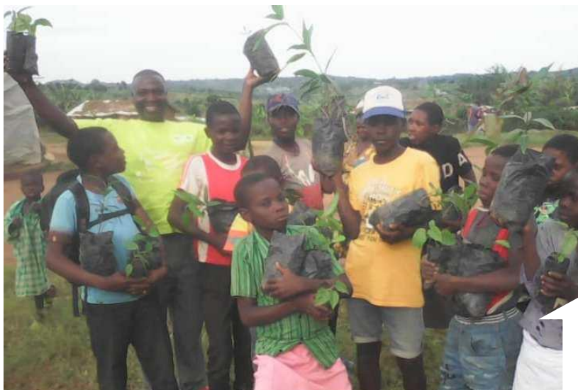
People rejoice after receiving fruit trees seedlings