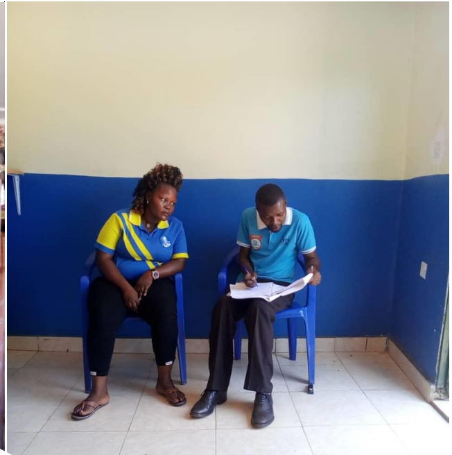
HEM staff fulfilling loan form of a client who wants to increase her business.