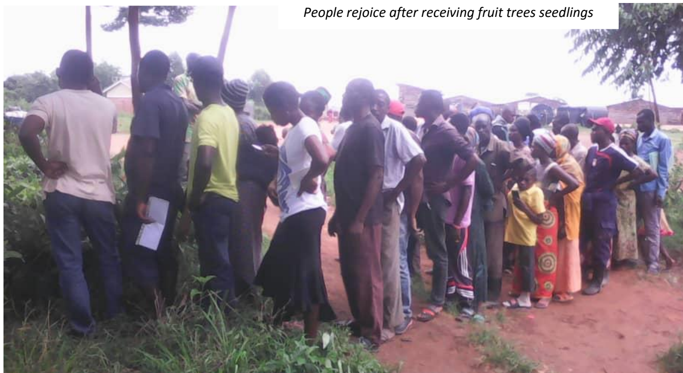
People waiting to receive seedlings of fruit trees in Kyaka II Refugee Settlement