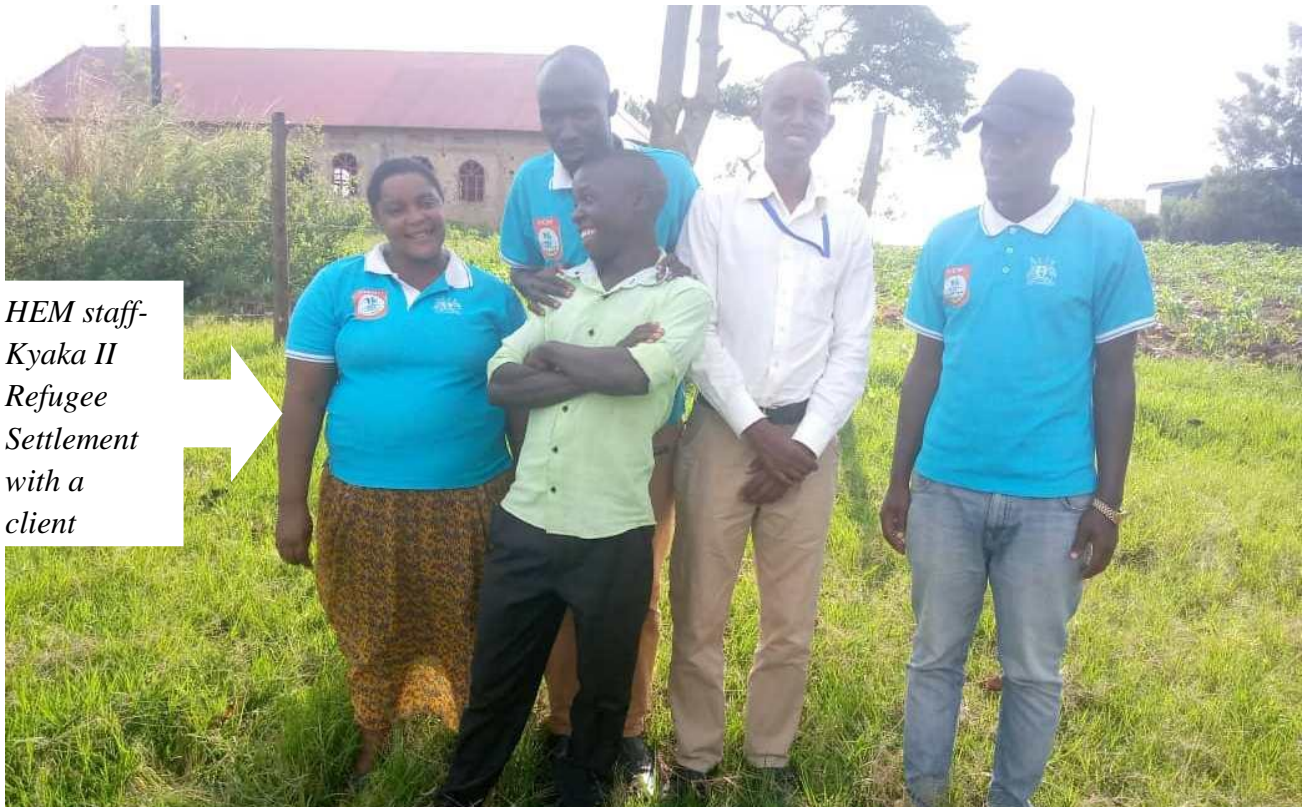
HEM staff- Kyaka II Refugee Settlement with a client