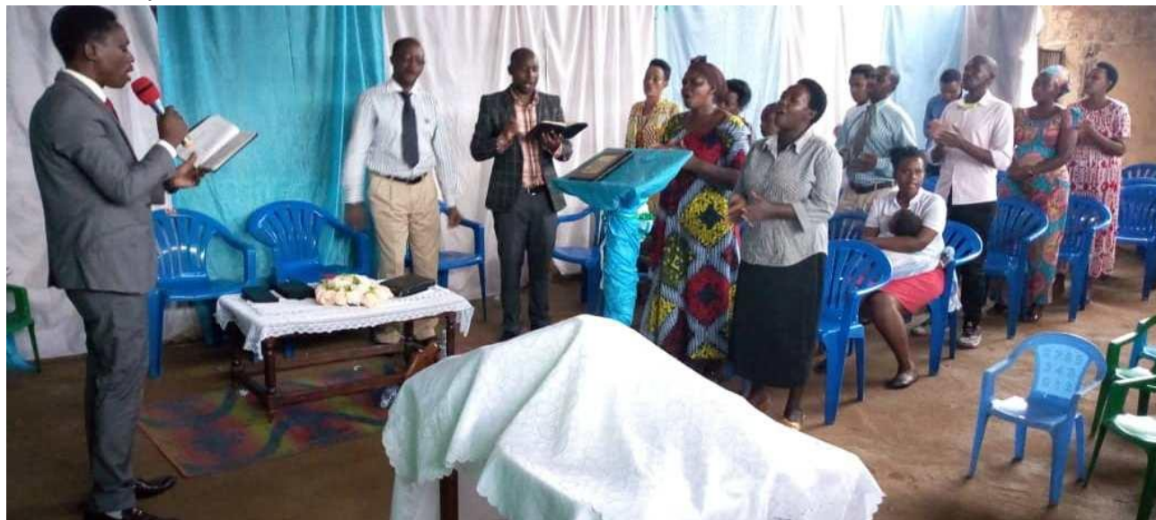
The Holy Communion is very important and takes part in the life of Christians in HEM PC.