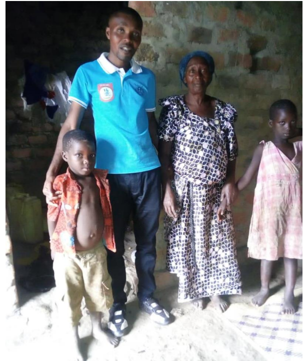
HEM staff is doing a great work for vulnerable people