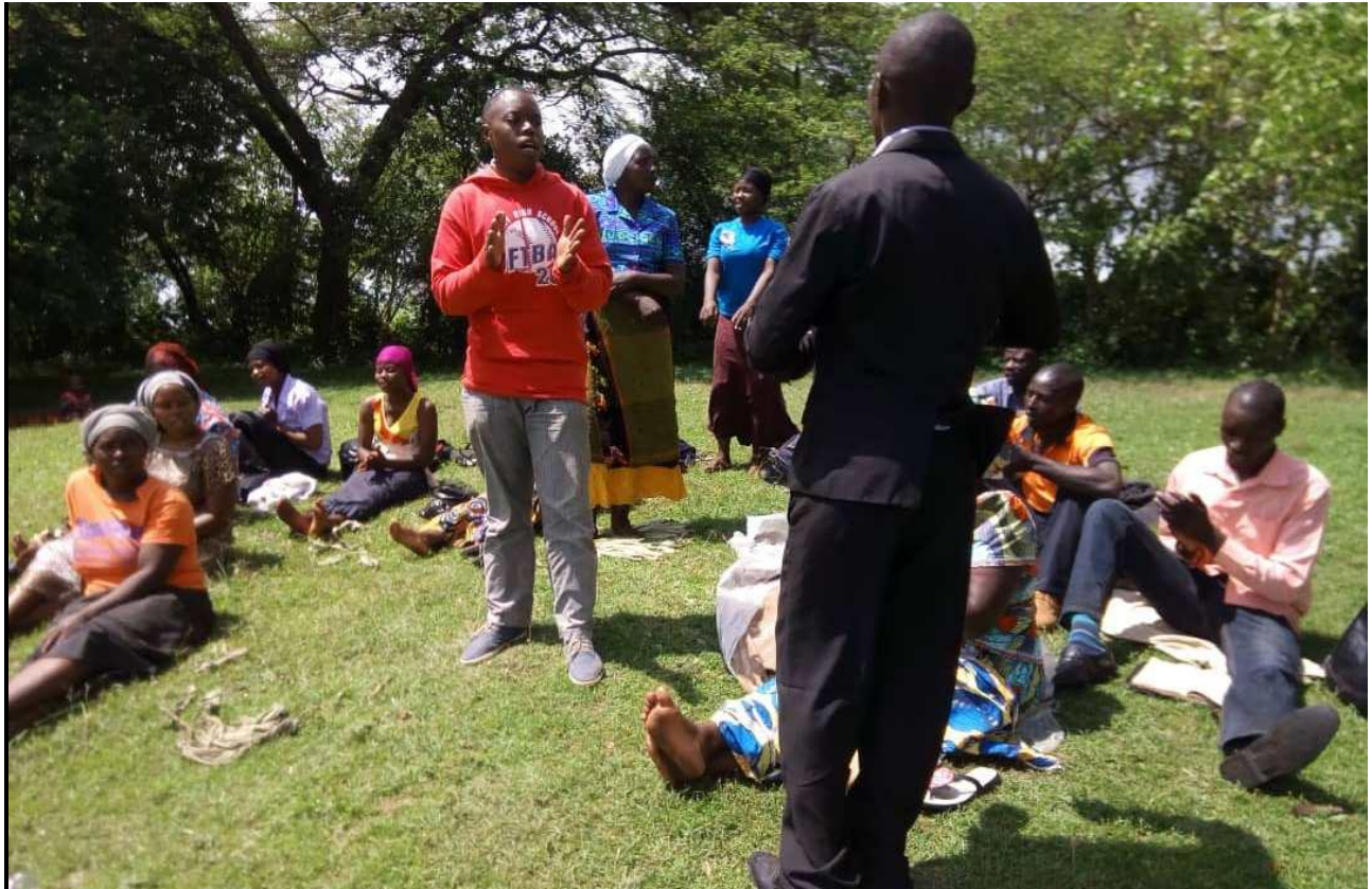
At Wakiso Prayer Mountain: lasting and praying day