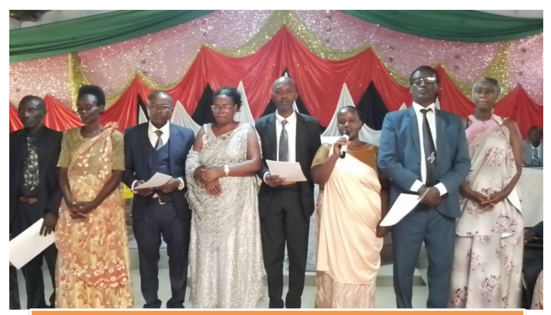
New Pastors and their Wives within Ordination Ceremony