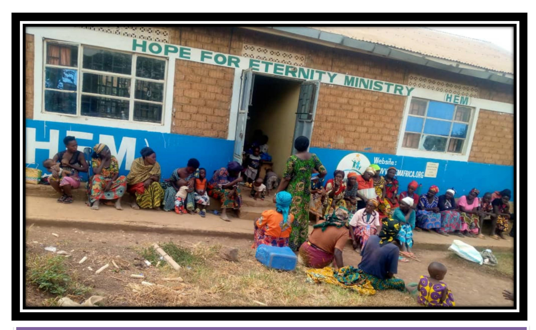
HEM Total orphans in Kyaka II Refugee Settlement waiting for food