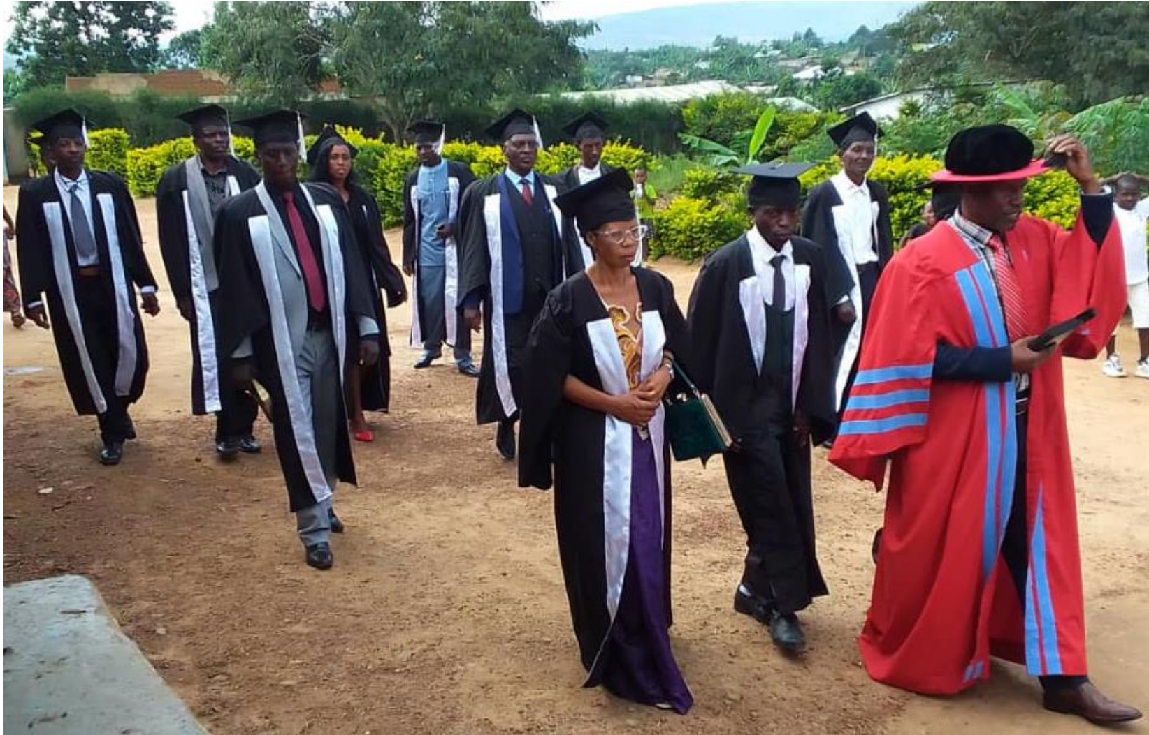
HEM Graduation in Nakivale